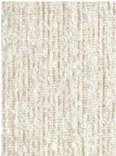
Cotton, Linen and Rayon Bouclé

Custom materials & finish matching available.