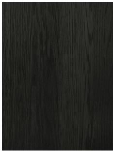
Black Stained Ash

STANDARD WOOD MATERIAL FINISHES Custom materials & finish matching available.