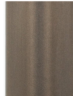
Medium Antique Brass