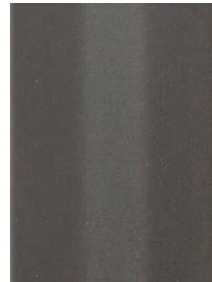
Oil Rubbed Bronze