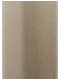
Nickel Brass Contrast