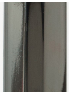
Polished Black Nickel