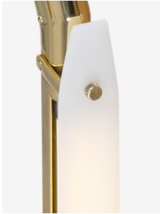
White Sandblast Glass

Custom materials & finish matching available.