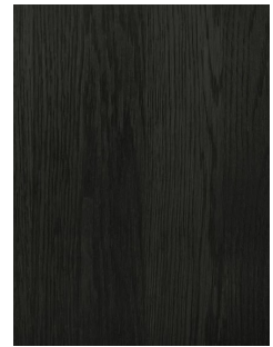
Black Stained Ash