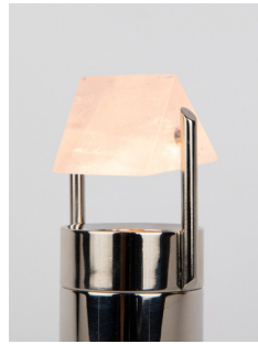
Rose Quartz Prism*