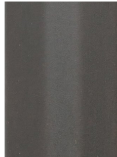
Oil Rubbed Bronze