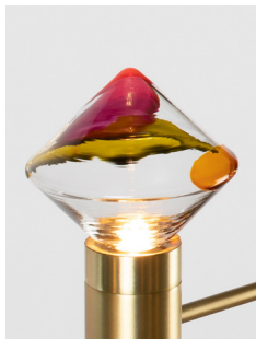
Hand Painted Diamond*