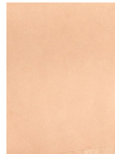
Veg Tan Leather