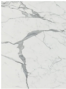
White Statuary Marble

Custom materials & finish matching available.