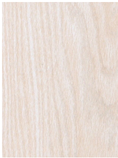
Bleached Red Oak

Custom materials & finish matching available.