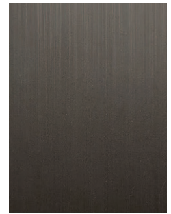
Darkened Brushed Bronze 01*