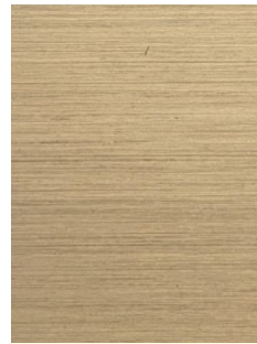
Brushed Bronze 01*