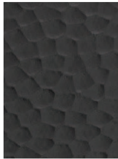
Hammered Metal 01*