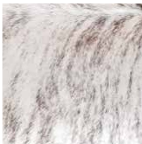
Grey Brindle Leather