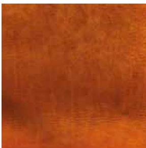
Cognac Saddle Leather