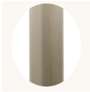
Nickel Brass Contrast