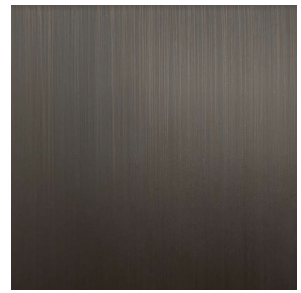
Darkened Brushed Bronze