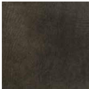
Black Horween Leather