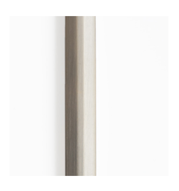
Nickel Brass Contrast