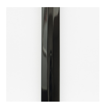
Polished Black Nickel