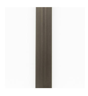
Medium Antique Brass