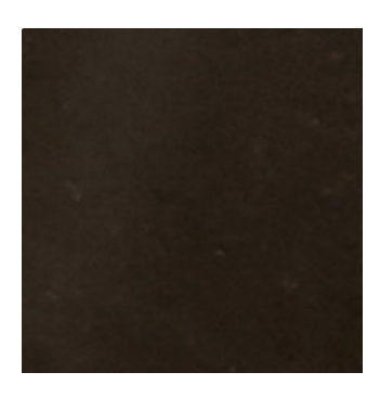
Absolute Black Granite