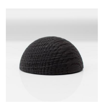
Flame Blackened Oak