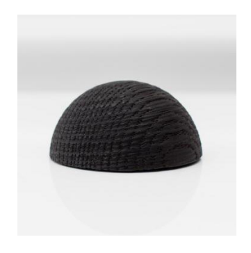
Flame Blackened Oak