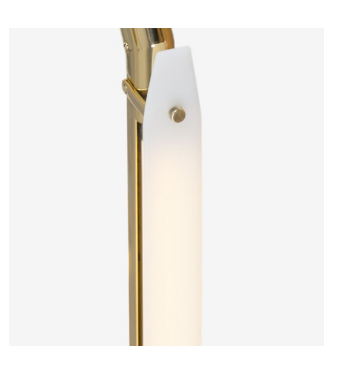
White Sandblast Glass