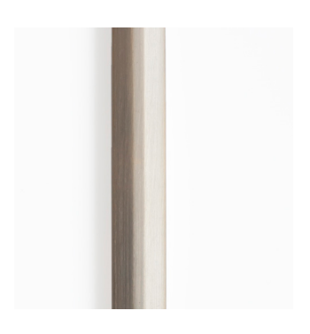
Nickel Brass Contrast