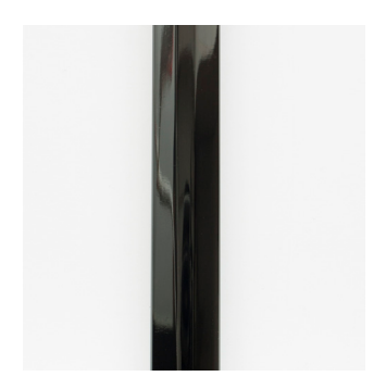
Polished Black Nickel