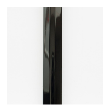
Polished Black Nickel