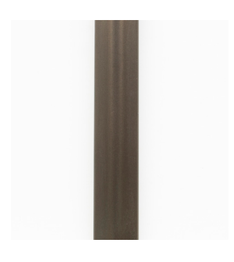
Medium Antique Brass