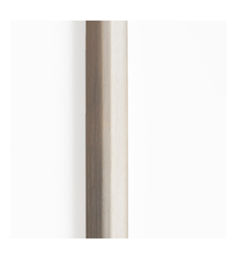
Nickel Brass Contrast