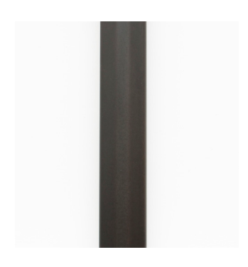
Oil Rubbed Bronze