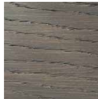
Gray Stained Oak