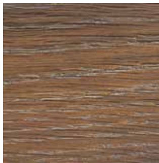
Limed Medium Stained Oak