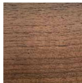
Clear Coated Walnut