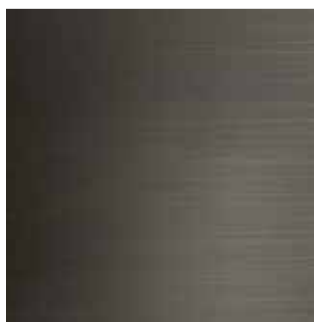
Darkened Brushed Bronze