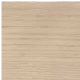
White Washed Ash