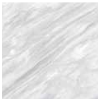
Honed Nuvolato Marble