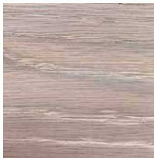
White Washed Oak