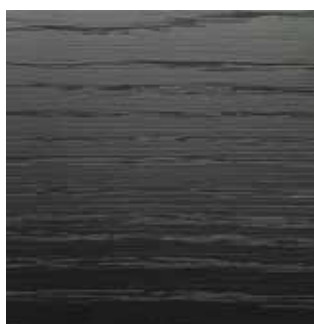
Black Stained Oak