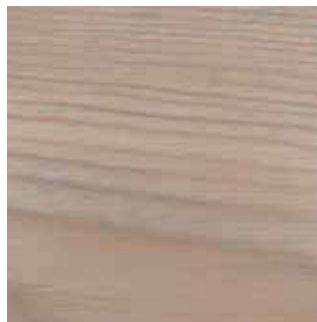
White Washed Ash