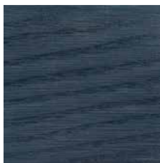
Indigo Stained Oak