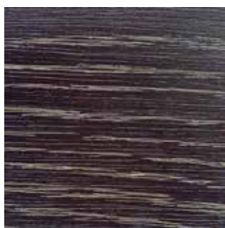
Limed Black Stained Oak