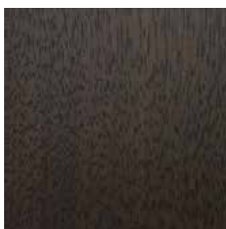
Dark Stained Walnut

*Please consult tear sheets for individual finish options.