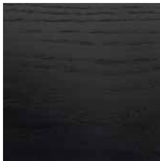
Black Stained Ash