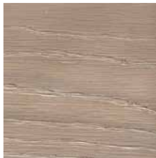
White Washed Oak