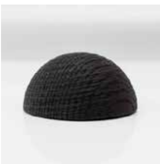
Flame Blackened Oak