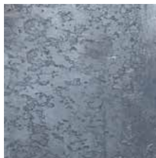
Raw Oiled Steel