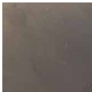
Antique Brass Plated Steel