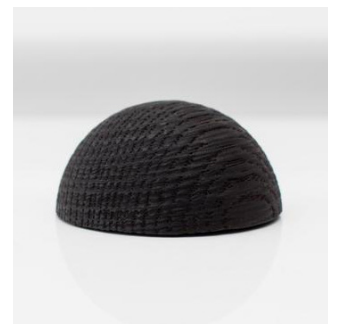
Flame Blackened Oak